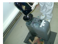
e.g. Pouring the waste liquid into the tank.